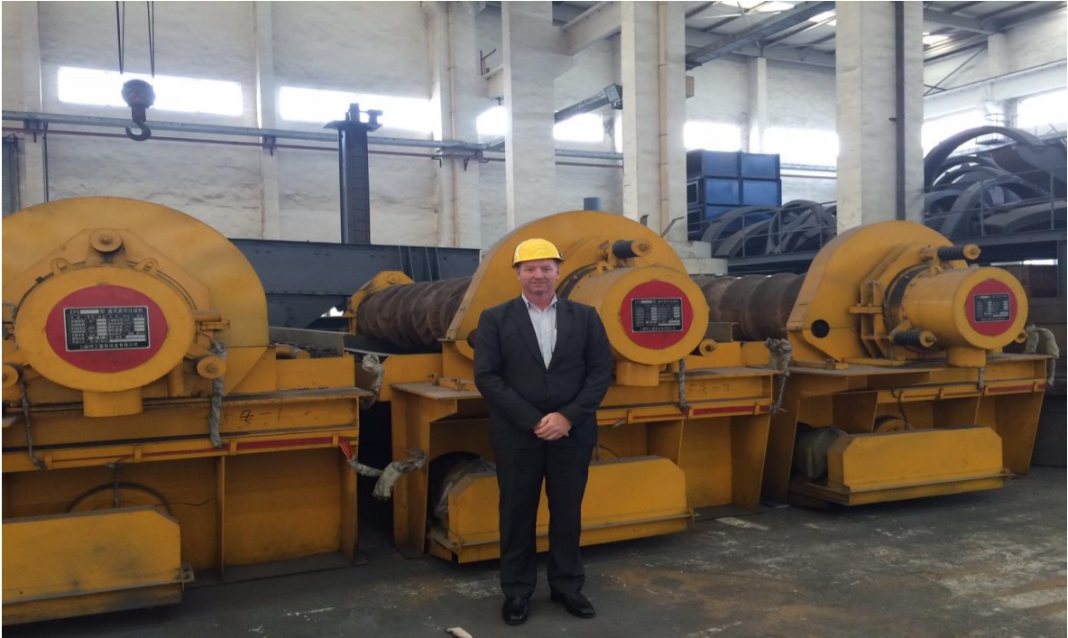
FIGURE 3: Vacuum Disc filters for water extraction