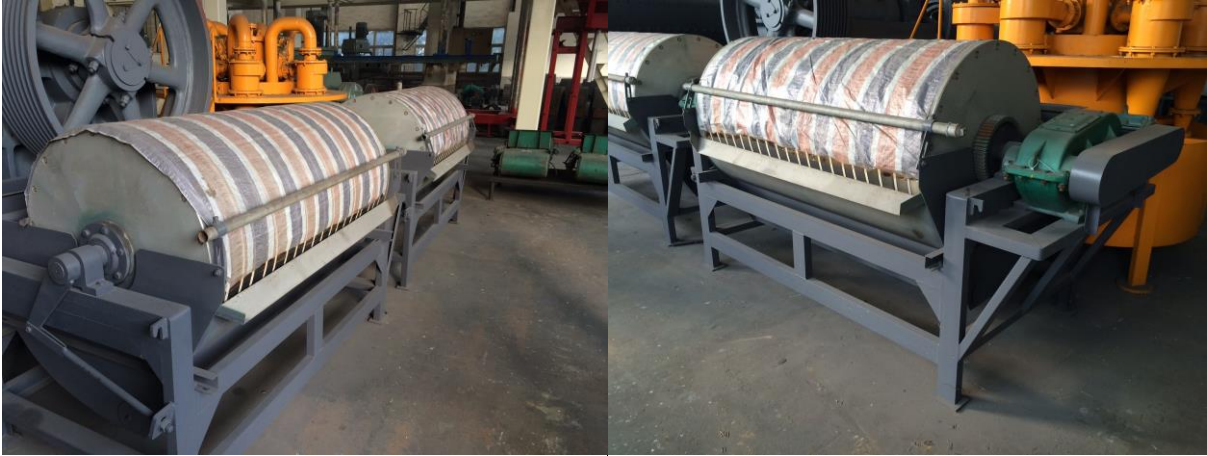
FIGURE 2: Low Intensity Magnets